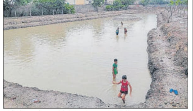
पुनर्विकसित किए गए गाजीपुर तालाब में खेलते बच्चे। इसके आसपास पार्क विकसित किया जाएगा।