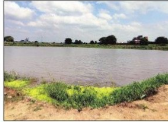
सफाई के बाद मोरटा का तालाब। अमर उजाला