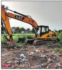
कूड़ा हटाती जेसीबी। अमर उजाला

गाजियाबाद। अस्तित्व खोते तालाबों को संजीवनी देकर जिंदा करने का काम जिले में युवाओं की टीम कर रही है। मोरटा में कूड़े से ढक चुके तालाब को युवाओं, ग्रामीणों और नगर निगम के प्रयासों से जीवन देने का काम किया गया। तालाब की सफाई में करीब 20 ट्रक कूड़ा निकालकर बाहर किया।